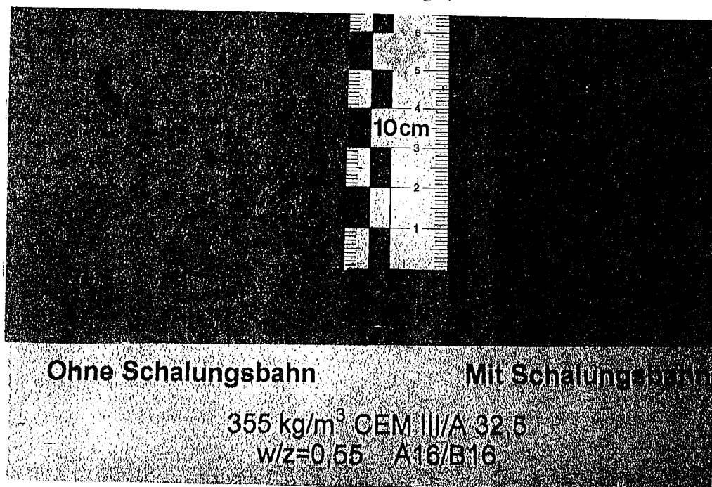
Fig. 2: Comparison between concrete surfaces made with (left) and without "Zemdrain MD" (right), Concrete 1

On demoulding, both the liners "Zemdrain MD" and "Zemdrain" could be removed without any problems from the concrete surfaces for both compositions (Concrete 1 or Concrete 2). In all cases, the surfaces were smooth and almost without surface voids.